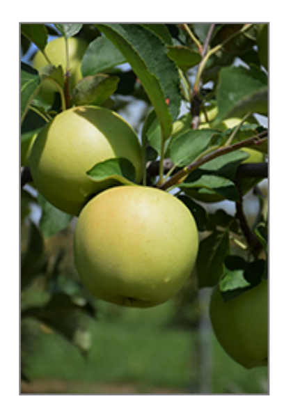
Golden Delicious Apple fruit

Golden Delicious Apple features showy clusters of lightly-scented white flowers with shell pink overtones along the branches in mid spring, which emerge from distinctive pink flower buds. It has forest green deciduous foliage. The pointy leaves turn yellow in fall. The fruits are showy chartreuse apples with yellow overtones, which are carried in abundance in mid fall. The fruit can be messy if allowed to drop on the lawn or walkways, and may require occasional clean-up.