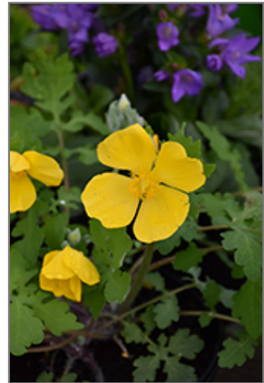
Celandine Poppy flowers