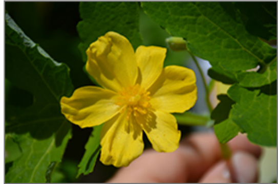
Celandine Poppy flowers