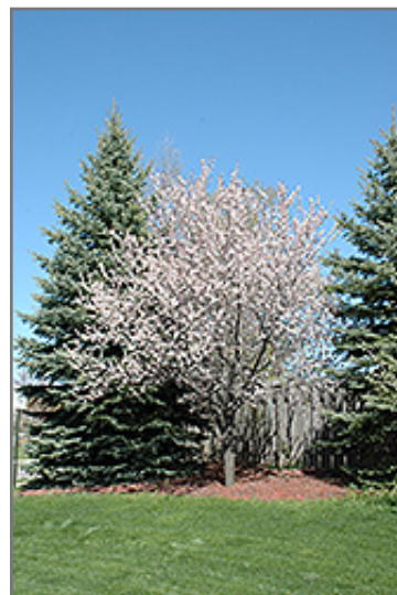
Newport Plum in bloom

This tree should only be grown in full sunlight. It does best in average to evenly moist conditions, but will not tolerate standing water. It is not particular as to soil type or pH. It is highly tolerant of urban pollution and will even thrive in inner city environments. This is a selected variety of a species not originally from North America.