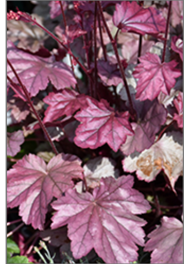
Stainless Steel Coral Bells foliage