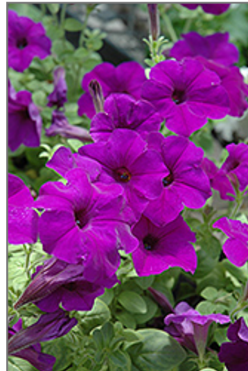
Easy Wave Blue Petunia flowers

Easy Wave Blue Petunia is recommended for the following landscape applications;