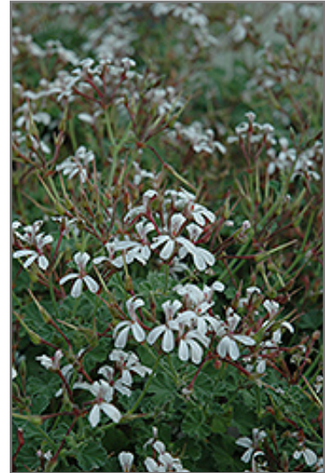
Scented Geranium flowers

Scented Geranium's attractive fragrant round palmate leaves remain green in color throughout the year on a plant with an upright spreading habit of growth. It features bold clusters of lightly-scented white flowers at the ends of the stems from late spring to early fall. The flowers are excellent for cutting.