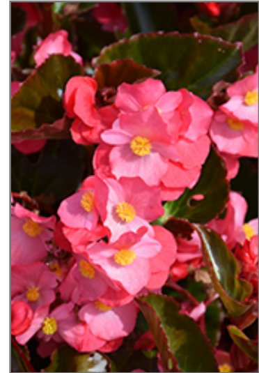
Big Rose Bronze Leaf Begonia flowers

Big Rose Bronze Leaf Begonia is recommended for the following landscape applications;