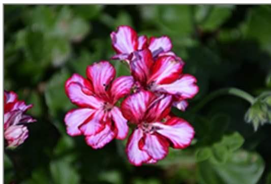
Precision Burgundy Ice Ivy Leaf Geranium flowers