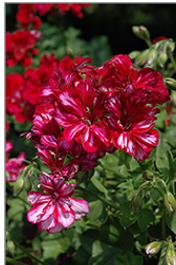
Precision Burgundy Ice Ivy Leaf Geranium flowers