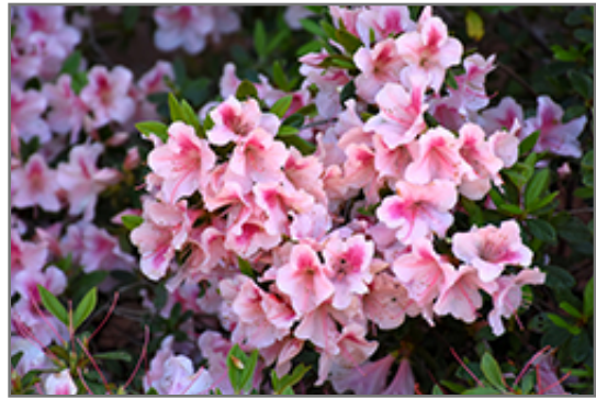
Encore Autumn Chiffon Azalea flowers

Clustered blooms that are light pink with a deep pink blotch cover this azalea in mid-spring with additional, lighter flushes in summer and fall; deep green glossy foliage emerges light green; needs highly acidic and organic soil that is well drained