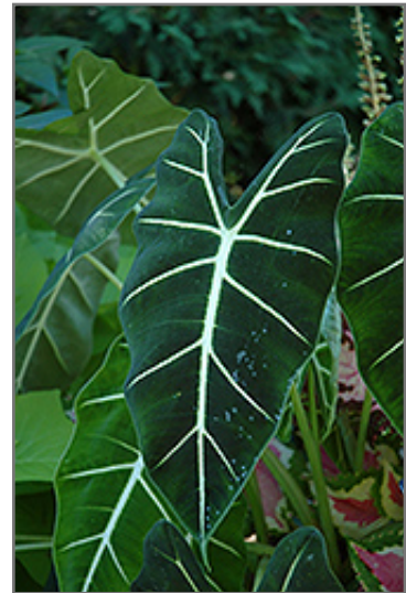
Frydek Elephant's Ear foliage

Frydek Elephant's Ear will grow to be about 3 feet tall at maturity, with a spread of 3 feet. Although it's not a true annual, this plant can be expected to behave as an annual in our climate if left outdoors over the winter, usually needing replacement the following year. As such, gardeners should take into consideration that it will perform differently than it would in its native habitat.