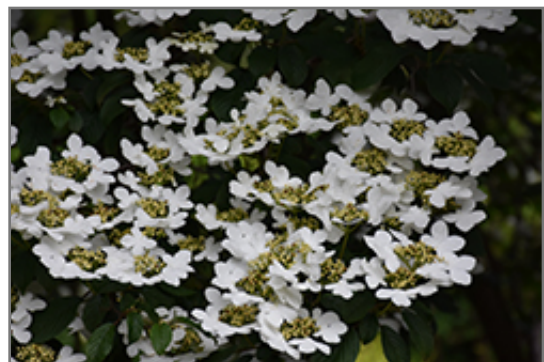
Summer Snowflake Doublefile Viburnum flowers