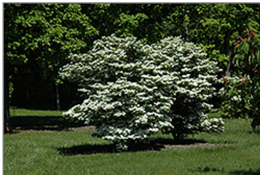
Summer Snowflake Doublefile Viburnum in bloom

This shrub does best in full sun to partial shade. It does best in average to evenly moist conditions, but will not tolerate standing water. It is not particular as to soil type or pH. It is highly tolerant of urban pollution and will even thrive in inner city environments. This is a selected variety of a species not originally from North America.