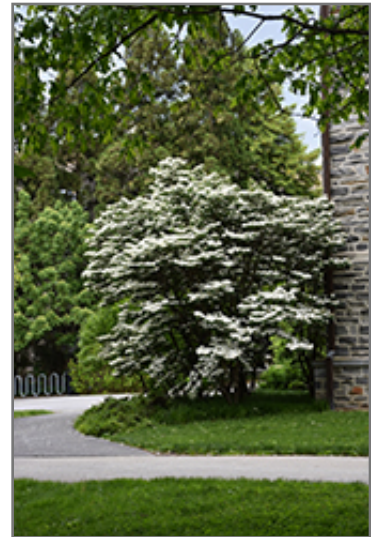
Summer Snowflake Doublefile Viburnum in bloom

Summer Snowflake Doublefile Viburnum is recommended for the following landscape applications;