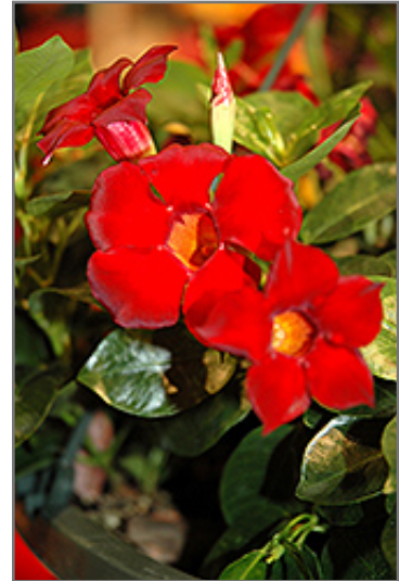
Rio Dark Red Mandevilla flowers

-- THIS IS A TROPICAL PLANT AND SHOULD NOT BE EXPECTED TO SURVIVE THE WINTER OUTDOORS IN OUR CLIMATE --