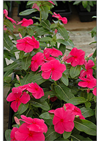
Mediterranean Deep Rose Vinca flowers

A beautiful trailing series with lush glossy, dark green foliage and showy vibrant colored blooms; a gorgeous addition to patio containers, hanging baskets and garden beds; a low maintenance selection with excellent heat and drought tolerance