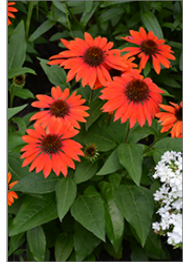
Sombrero Flamenco Orange Coneflower in bloom

Sombrero Flamenco Orange Coneflower is recommended for the following landscape applications;