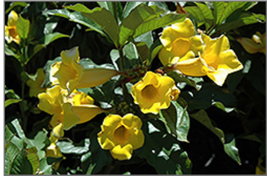
Golden Trumpet flowers