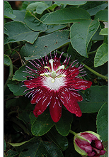
Purple Passionfruit flowers