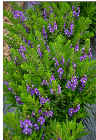
Adessa Blue Angelonia in bloom