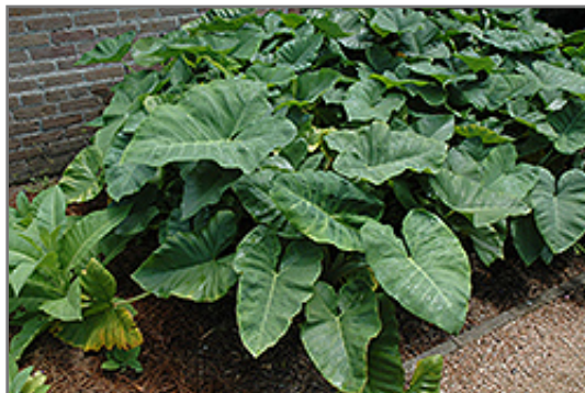
Elephant's Ear