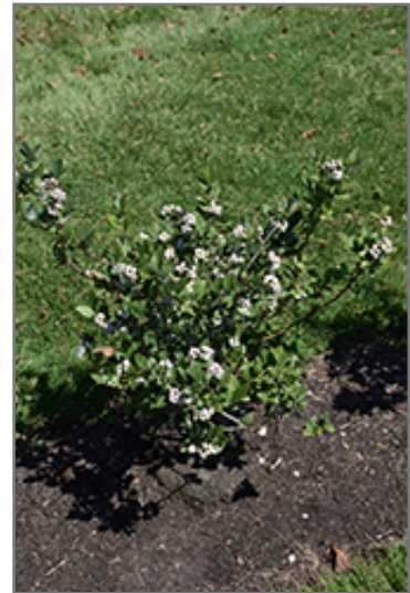
Elliott Blueberry fruit