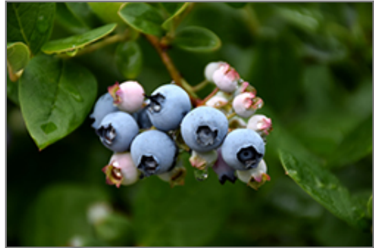
Elliott Blueberry fruit

Elliott Blueberry features dainty clusters of white bell-shaped flowers with shell pink overtones hanging below the branches in mid spring. It has green deciduous foliage. The glossy oval leaves turn yellow in fall. It features an abundance of magnificent blue berries from late summer to early fall. The smooth brick red bark adds an interesting dimension to the landscape.