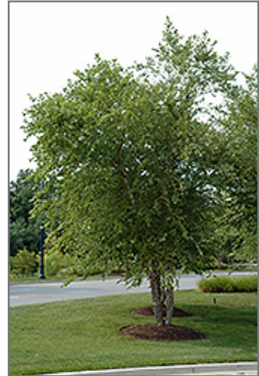
River Birch (clump)

River Birch (clump) will grow to be about 60 feet tall at maturity, with a spread of 45 feet. It has a low canopy with a typical clearance of 3 feet from the ground, and should not be planted underneath power lines. It grows at a fast rate, and under ideal conditions can be expected to live for 70 years or more.