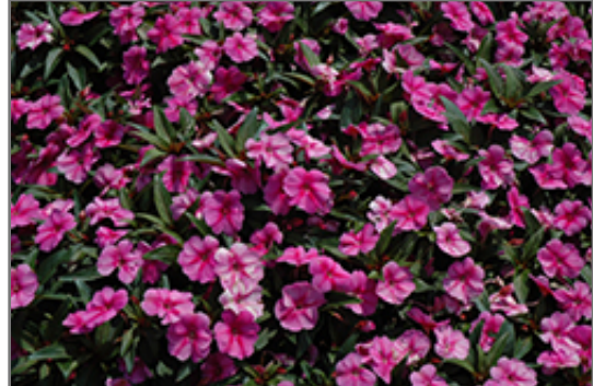
Bounce Pink Flame Impatiens flowers