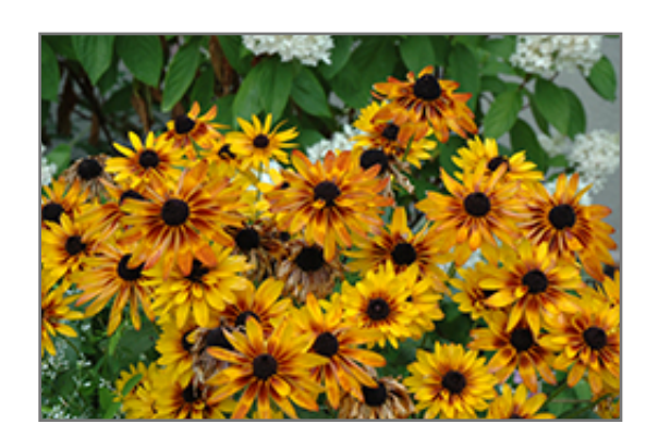
Gold Rush Coneflower flowers