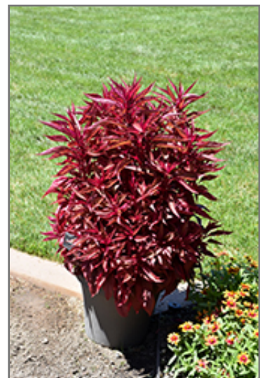
Dragon's Breath Plumed Celosia