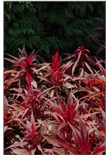
Dragon's Breath Plumed Celosia flowers

Dragon's Breath Plumed Celosia is recommended for the following landscape applications;