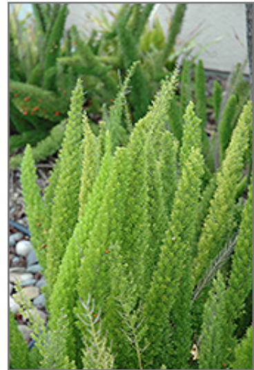
Foxtail Fern

When grown indoors, Foxtail Fern can be expected to grow to be about 24 inches tall at maturity, with a spread of 24 inches. It grows at a medium rate, and under ideal conditions can be expected to live for approximately 15 years. This houseplant will do well in a location that gets either direct or indirect sunlight, although it will usually require a more brightly-lit environment than what artificial indoor lighting alone can provide. It does best in average to evenly moist soil, but will not tolerate standing water. The surface of the soil shouldn't be allowed to dry out completely, and so you should expect to water this plant once and possibly even twice each week. Be aware that your particular watering schedule may vary depending on its location in the room, the pot size, plant size and other conditions; if in doubt, ask one of our experts in the store for advice. It is not particular as to soil pH, but grows best in rich soil. Contact the store for specific recommendations on pre-mixed potting soil for this plant.