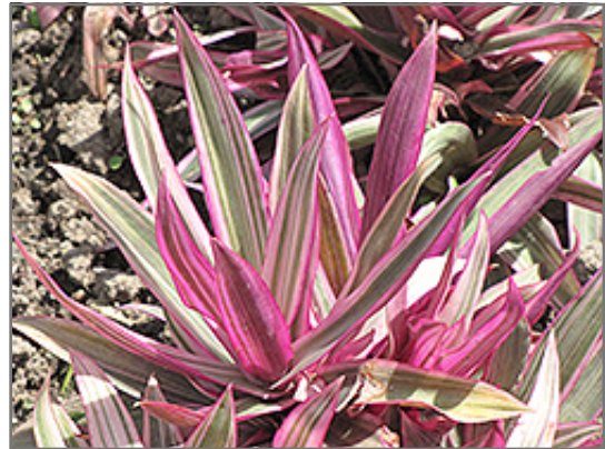
Variegated Moses In The Cradle foliage

When grown indoors, Variegated Moses In The Cradle can be expected to grow to be about 12 inches tall at maturity, with a spread of 24 inches. It grows at a fast rate, and under ideal conditions can be expected to live for approximately 10 years. This houseplant will do well in a location that gets either direct or indirect sunlight, although it will usually require a more brightly-lit environment than what artificial indoor lighting alone can provide. It prefers to grow in average to moist soil. The surface of the soil shouldn't be allowed to dry out completely, and so you should expect to water this plant once and possibly even twice each week. Be aware that your particular watering schedule may vary depending on its location in the room, the pot size, plant size and other conditions; if in doubt, ask one of our experts in the store for advice. It is not particular as to soil type or pH; an average potting soil should work just fine.