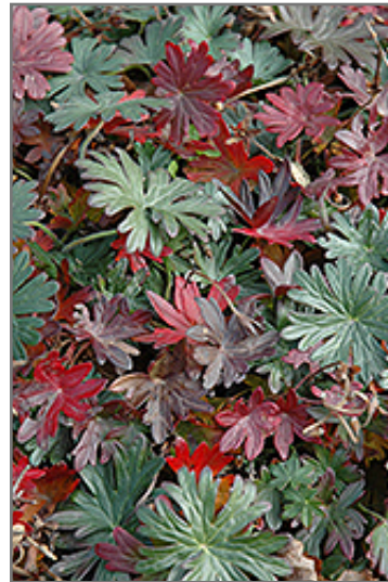
Bloody Cranesbill in fall

Bloody Cranesbill is a fine choice for the garden, but it is also a good selection for planting in outdoor pots and containers. It is often used as a 'filler' in the 'spiller-thriller-filler' container combination, providing a mass of flowers against which the thriller plants stand out. Note that when growing plants in outdoor containers and baskets, they may require more frequent waterings than they would in the yard or garden.