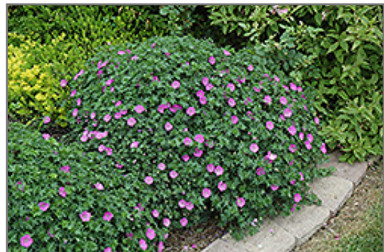
Bloody Cranesbill in bloom