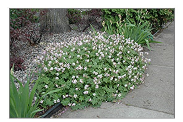
Biokovo Cranesbill in bloom

Biokovo Cranesbill is recommended for the following landscape applications;