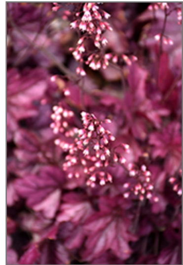
Wild Rose Coral Bells flowers