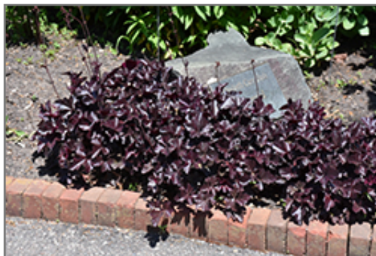
Obsidian Coral Bells