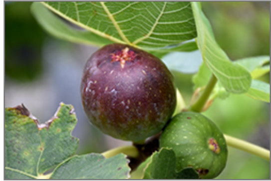
Brown Turkey Fig fruit

An attractive deciduous garden tree producing exceptional, tasty, brownish purple fruits with pink-amber flesh that ripen in early summer; attracts birds; needs hot exposure to ripen fruit in cooler areas