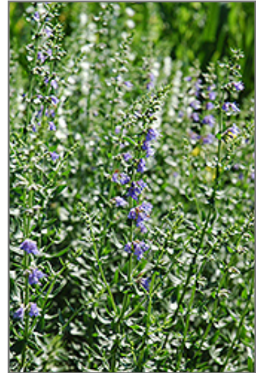
Hyssop flowers

Aside from its primary use as an edible, Hyssop is suitable for the following landscape applications;