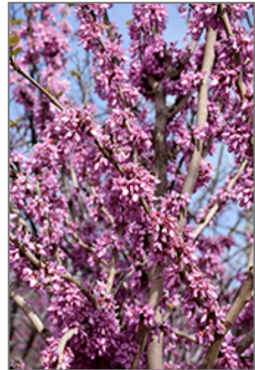
Bubble Gum Redbud flowers

Bubble Gum Redbud will grow to be about 12 feet tall at maturity, with a spread of 12 feet. It has a low canopy with a typical clearance of 1 foot from the ground, and is suitable for planting under power lines. It grows at a medium rate, and under ideal conditions can be expected to live for 60 years or more.