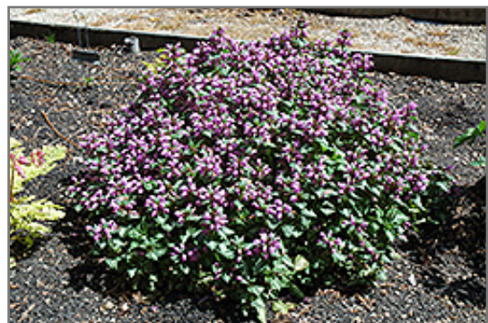
Beacon Silver Spotted Dead Nettle in bloom