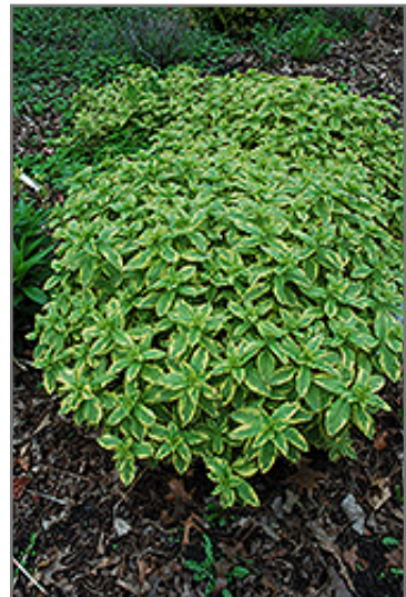
Golden Alexander Loosestrife