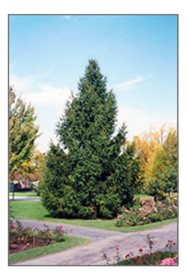
Norway Spruce