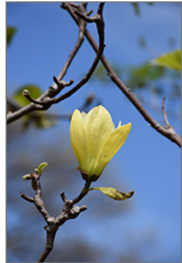
Butterflies Magnolia flowers

Butterflies Magnolia will grow to be about 20 feet tall at maturity, with a spread of 18 feet. It has a low canopy with a typical clearance of 2 feet from the ground, and is suitable for planting under power lines. It grows at a medium rate, and under ideal conditions can be expected to live for 50 years or more.