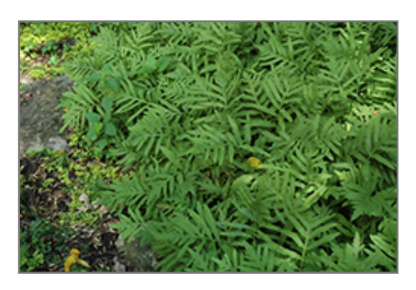
Sensitive Fern