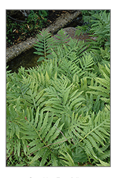
Sensitive Fern foliage