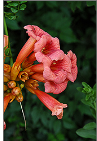
Trumpetvine flowers