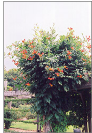
Trumpetvine in bloom