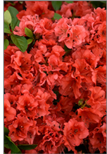
Girard's Hot Shot Azalea flowers

Girard's Hot Shot Azalea will grow to be about 30 inches tall at maturity, with a spread of 30 inches. It has a low canopy. It grows at a slow rate, and under ideal conditions can be expected to live for 40 years or more.