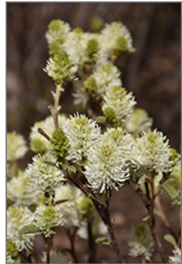
Mt. Airy Fothergilla flowers

Mt. Airy Fothergilla is recommended for the following landscape applications;