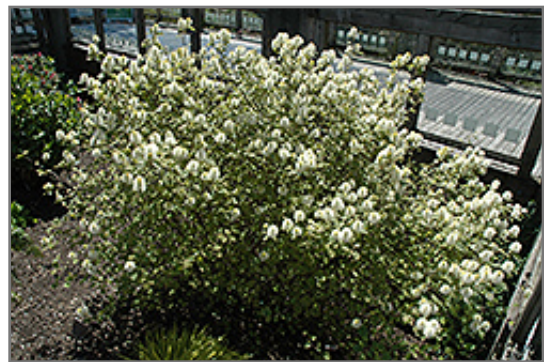
Mt. Airy Fothergilla in bloom