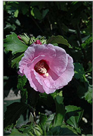
Minerva Rose of Sharon flowers

Minerva Rose of Sharon is recommended for the following landscape applications;