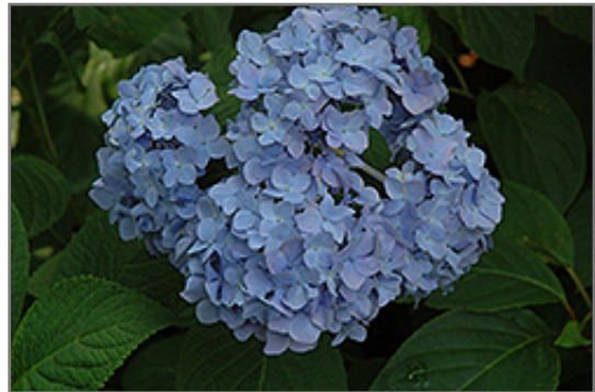
Nikko Blue Hydrangea flowers