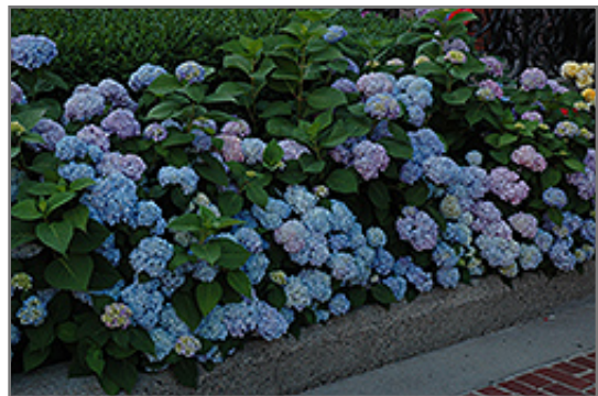
Nikko Blue Hydrangea in bloom