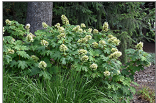
Alice Hydrangea in bloom