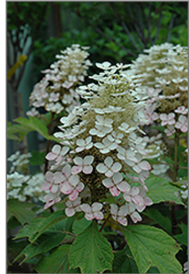
Alice Hydrangea flowers

Alice Hydrangea is recommended for the following landscape applications;