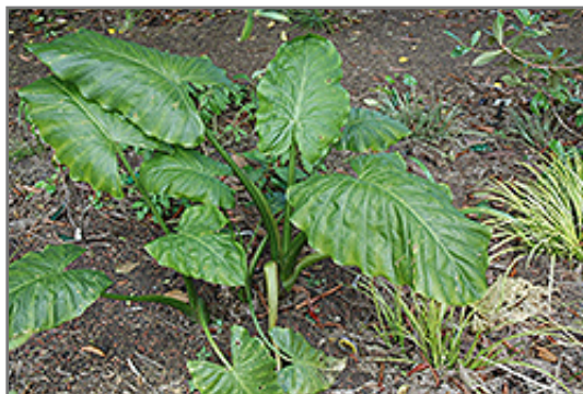
Elephant's Ear