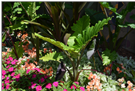
Elephant's Ear