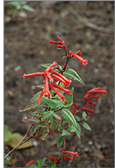
Cigar Flower flowers

Cigar Flower will grow to be about 16 inches tall at maturity, with a spread of 18 inches. Its foliage tends to remain dense right to the ground, not requiring facer plants in front. Although it's not a true annual, this plant can be expected to behave as an annual in our climate if left outdoors over the winter, usually needing replacement the following year. As such, gardeners should take into consideration that it will perform differently than it would in its native habitat.