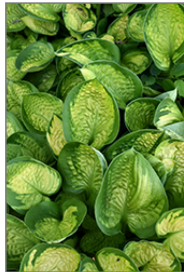
Rainforest Sunrise Hosta foliage

Rainforest Sunrise Hosta is recommended for the following landscape applications;