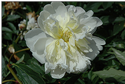
Primevere Peony flowers

Fragrant, double flowers with large, outer guard petals that are nearly white with a slight blush, the guard petals surround fluffy, narrow, lemon yellow petals in the center that fade to creamy-white