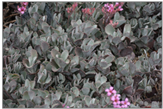
Flower Dust Plant foliage

Flower Dust Plant will grow to be about 8 inches tall at maturity extending to 12 inches tall with the flowers, with a spread of 24 inches. When grown in masses or used as a bedding plant, individual plants should be spaced approximately 18 inches apart. Its foliage tends to remain low and dense right to the ground. Although it's not a true annual, this plant can be expected to behave as an annual in our climate if left outdoors over the winter, usually needing replacement the following year. As such, gardeners should take into consideration that it will perform differently than it would in its native habitat.