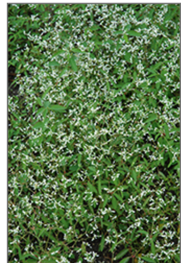
Breathless White Euphorbia flowers