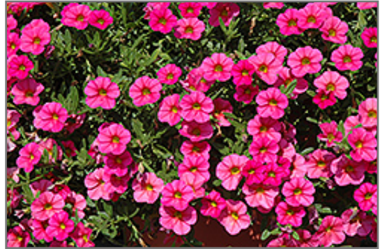
Cabaret Hot Pink Calibrachoa flowers

Cabaret Hot Pink Calibrachoa is recommended for the following landscape applications;